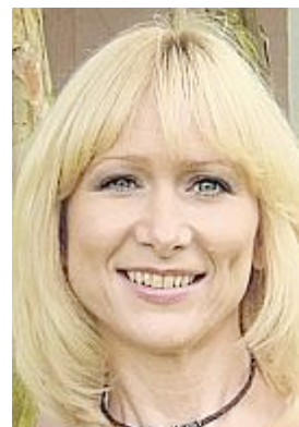
The real Cher.