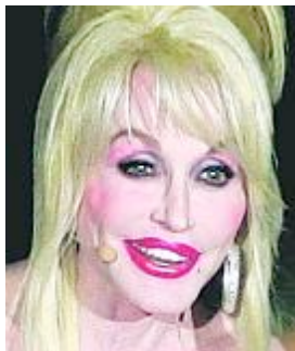
The real Dolly Parton

Ms Irion remembers when she was at a hotel waiting to be picked up by a limousine for an event when a couple of fans asked if she was Cher.